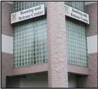
The county’s Booking and Release Center.

“The WSO facilitates the custodial transfer of specific aliens in Orange County Corrections Department (OCCD) facilities to ICE for removal purposes at the time of the alien’s scheduled release from crimi-