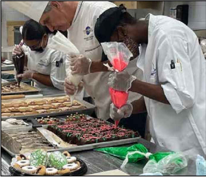
Wekiva Culinary students decorate cookies for the Great Christmas Cookie Gift Box Sale.