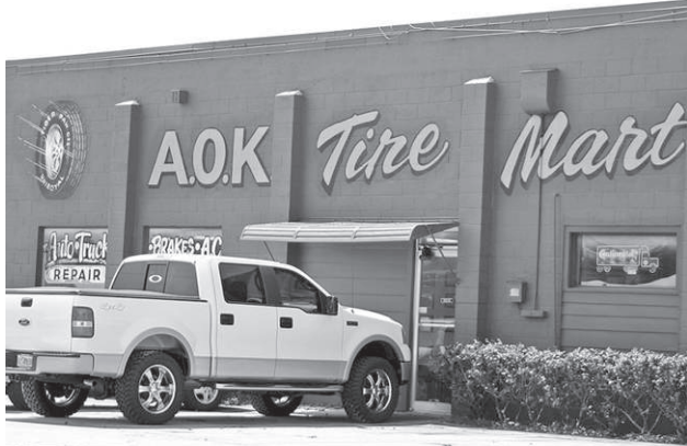
A.O.K. Tire Mart is conveniently located in downtown Apopka at 200 W. Main Street or call 407-889-7074 for more information.

A.O.K. Tire Mart is Apopka's choice for experienced personnel and top-quality products for all your vehicles. They're a family-owned and operated business,