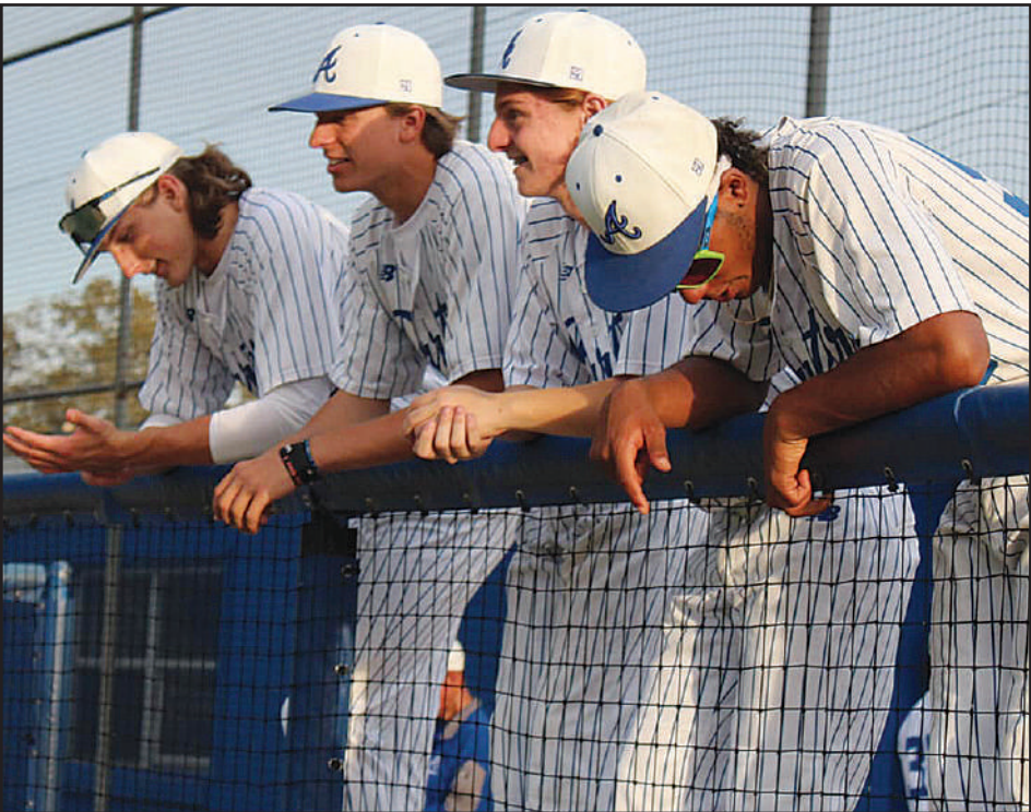
A few Blue Darters talk in the dugout in their game against Mount Dora Christian Academy on Monday, April 1.