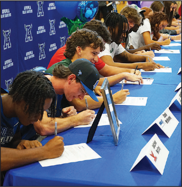
On Wednesday, April 17, a group of male Apopka athletes sign their paper work.