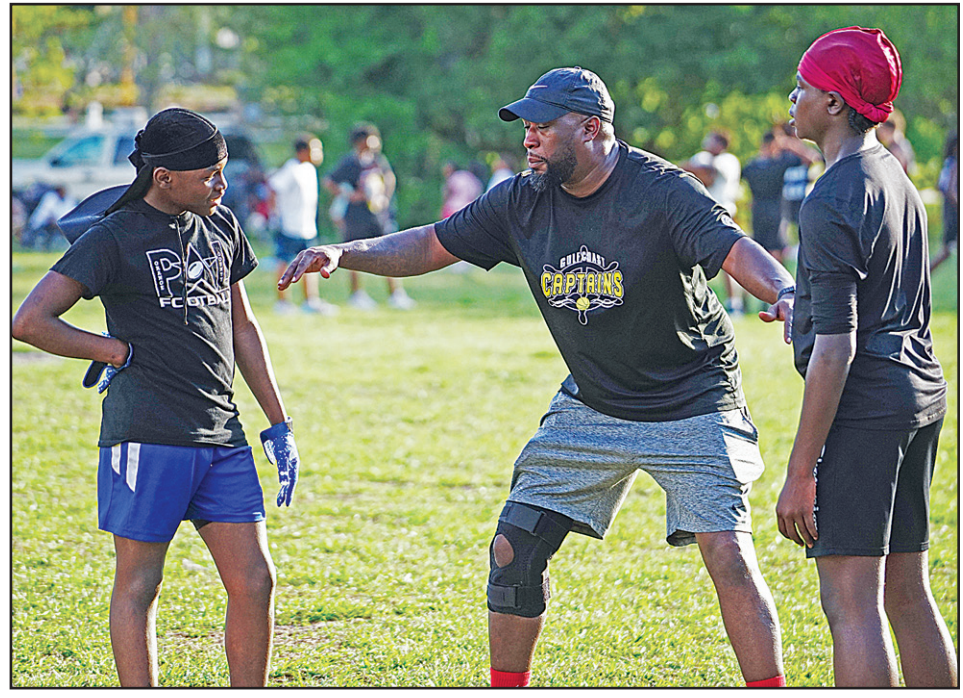
drill working on zig routes.