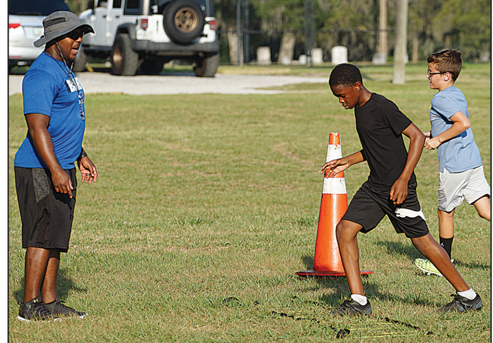
On Monday, June 10, a coach leads players through a ladder drill to work on footwork and agility.