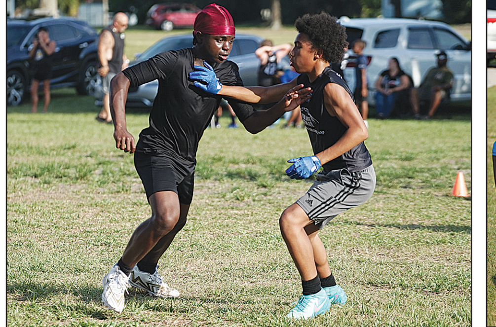
A receiver (I) works to get out of a jam at the line of scrimmage against another receiver posing as a defensive back during off-season conditioning.