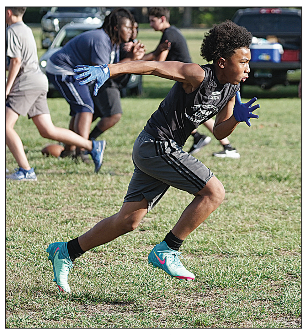
On Monday, June 10, a wide receiver takes off on a fly route working on over the shoulder catches.