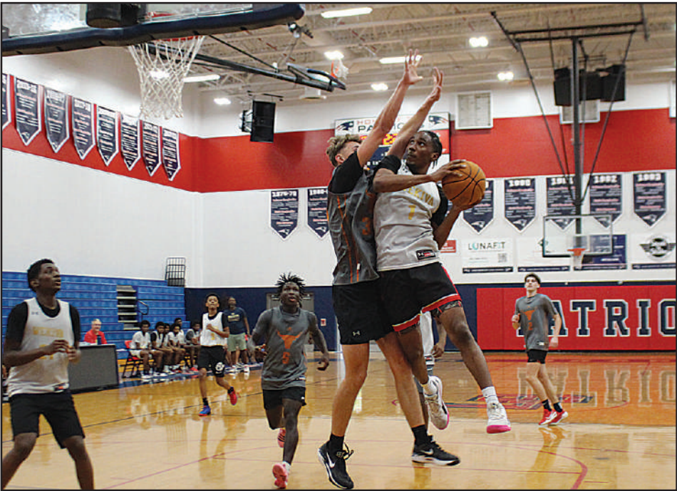
Goong up for a tough layup, a Wekiva player looks to finish through the contact of an opposing player.