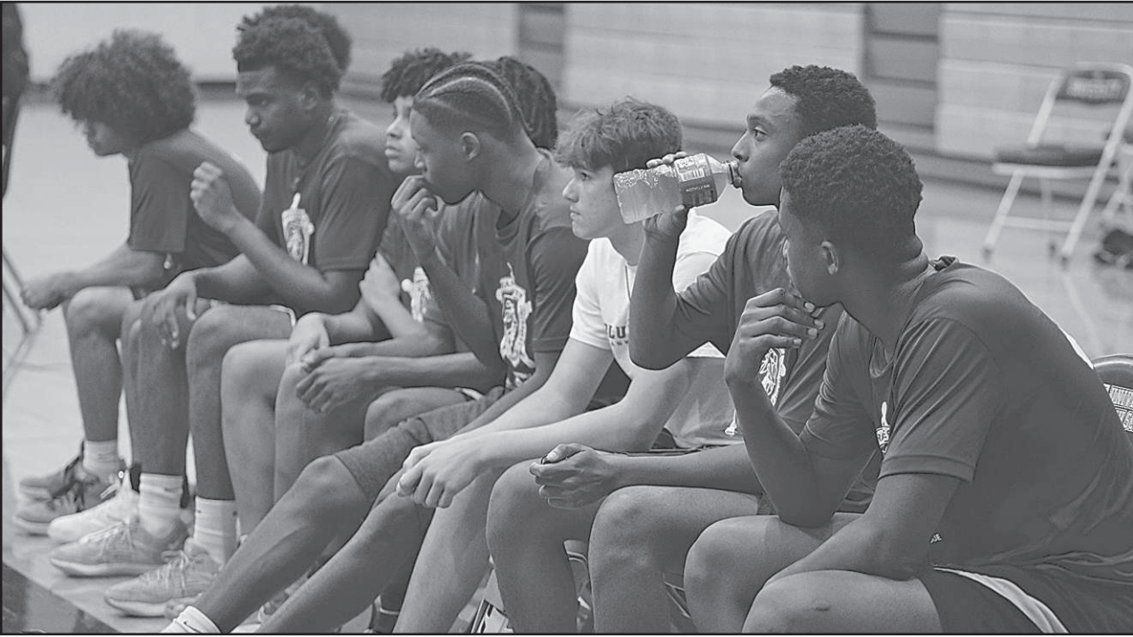
On Tuesday, June 18, the Apopka basketball team sits and rehydrates during halftime in their game against Lake Howell which they lost in sudden death.