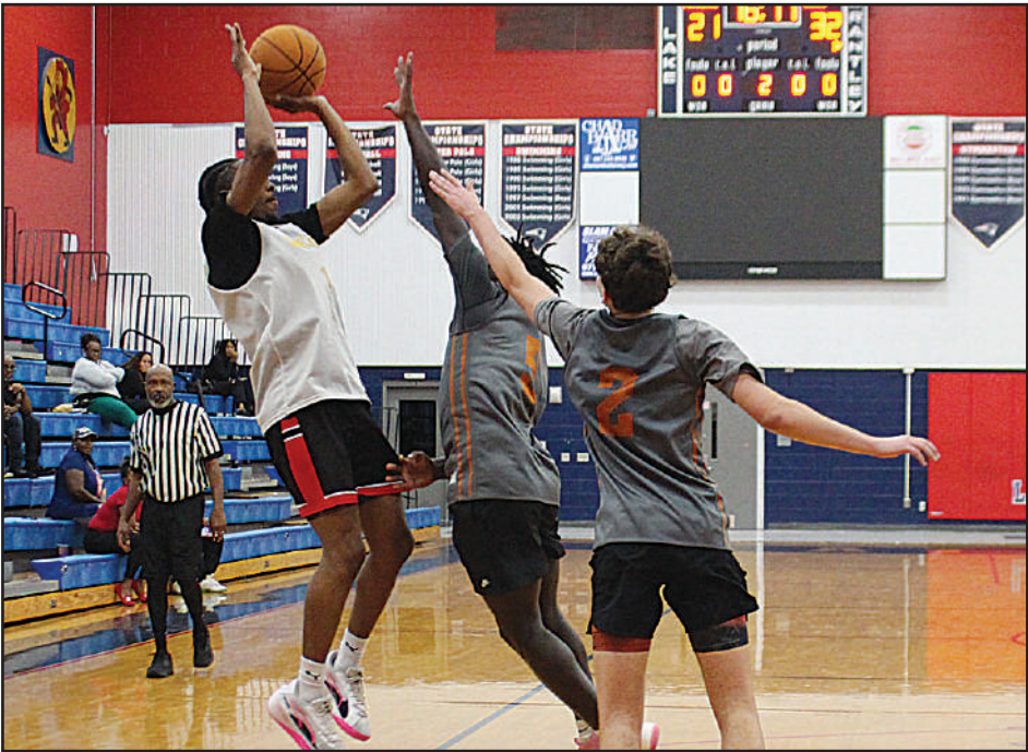
A Wekiva player goes up for a jump shot while fading away during a summer league game.