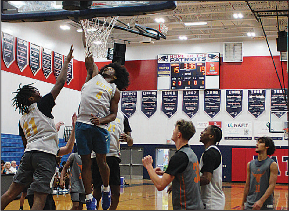
A Wekiva player goes up for a putback bucket during a summer game at Lake Brantley High School's gymnasium.