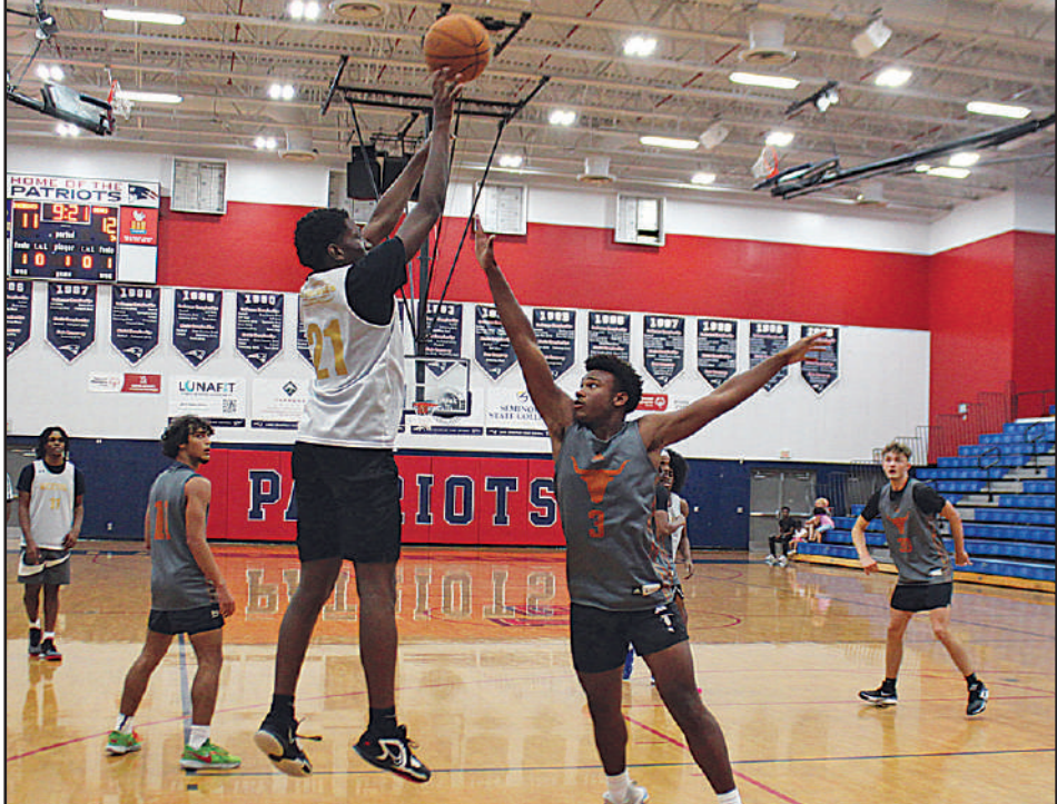
A Wekiva player elevates on a jump shot top shoot over the incoming defender during a summer league game.