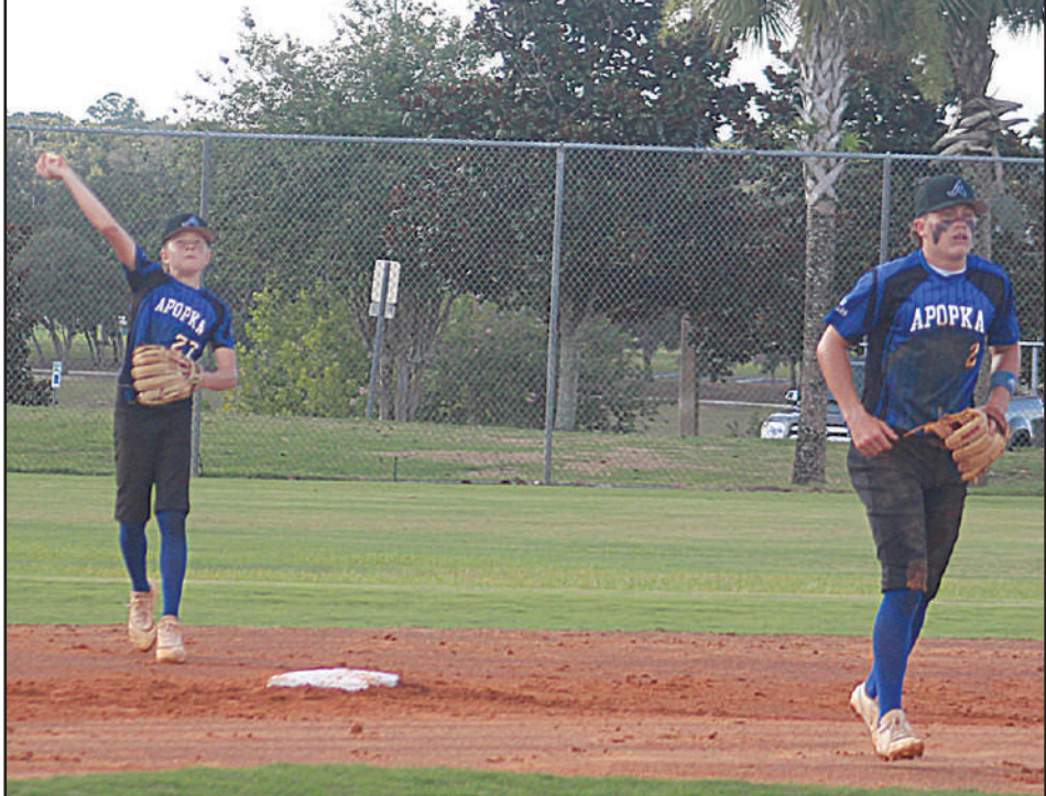
Heading back to the dugout, an Apopka Little League player throws the ball home.