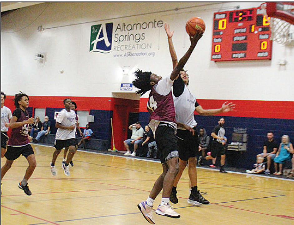
A Wekiva player goes up for a layup on a fast break with a defender going for a block.