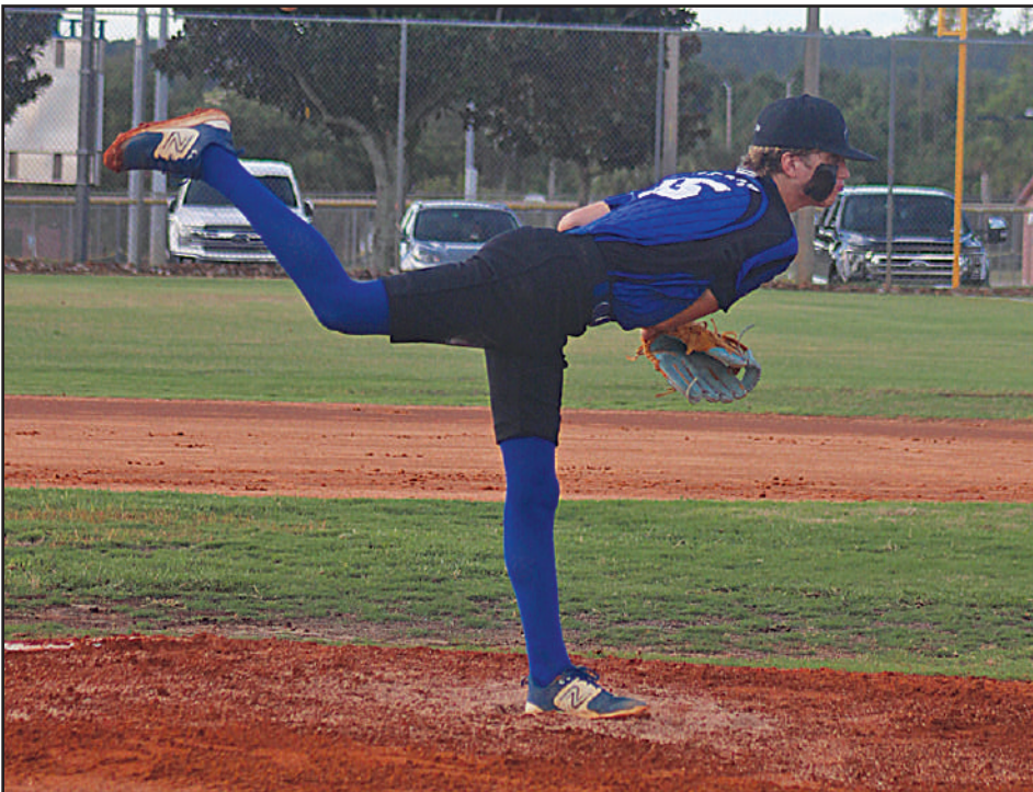
An Apopka Little League pitcher looks at the placement of his pitch right after letting it go.