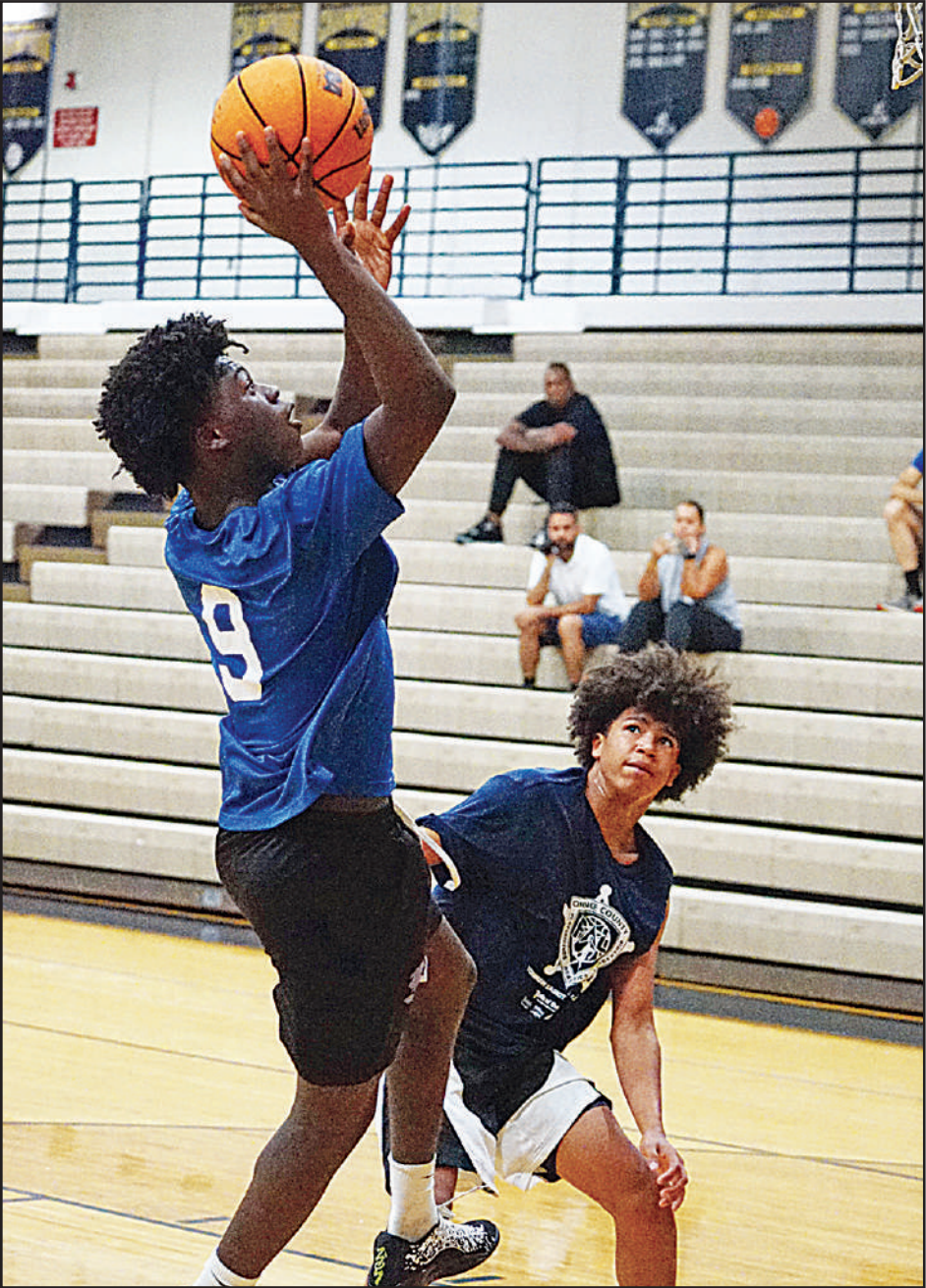
On Tuesday, June 18th, An Apopka high school player fades back as he goes for a jumper inside of the paint.