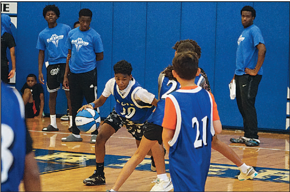
At Joe A. Sterling gym a camper sets a screen for their teammate that opens up a lane to the basket.