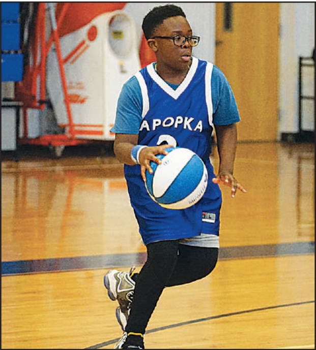
On Tuesday, June 4, a camper starts a possession looking for a lane to the basket.