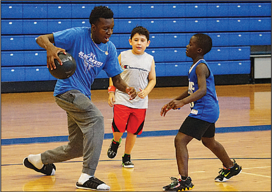
An Apopka player coach uses his ball handling skills to play keep away from two campers trying to steal the ball.