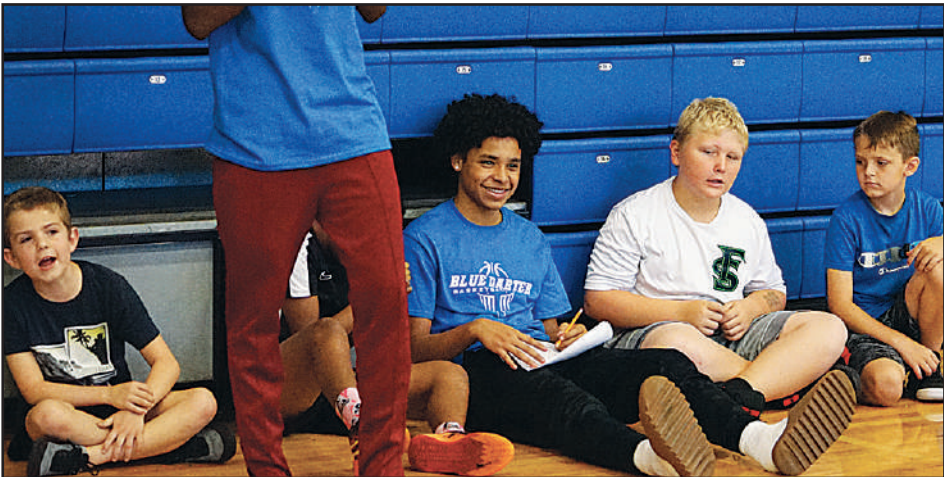
A player coach (third from the right) sits with his team while joking and going over game strategy before five-on-five scrimmage.