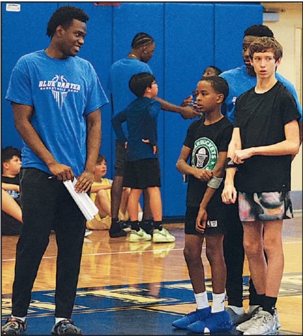
An Apopka player coach talks with another coach and a few members of his five-on-five team.