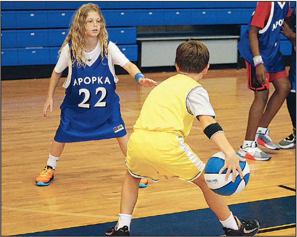
On the right a camper tries a few ball handling moves looking to create space from a defending camper.