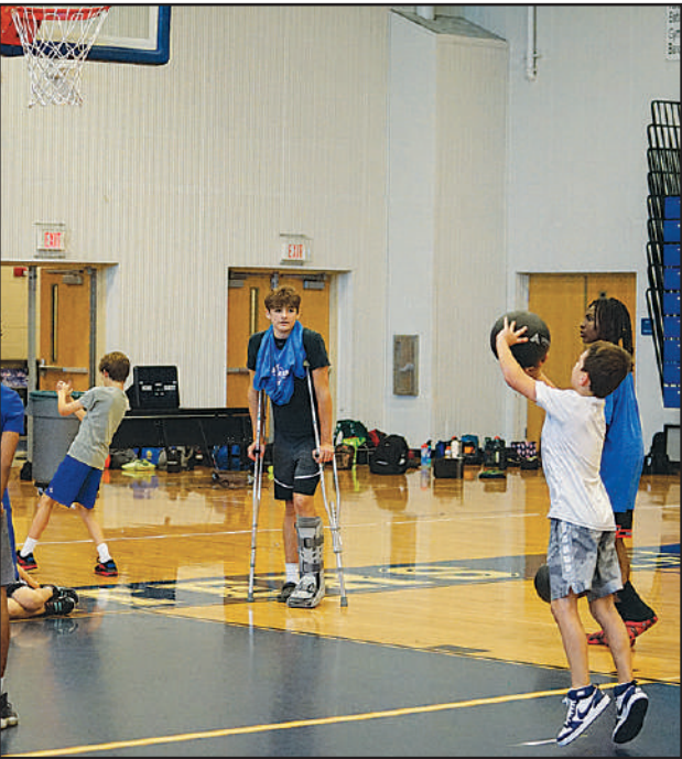
Two player coaches give advice to a camper as they warm up and shoot free throws.