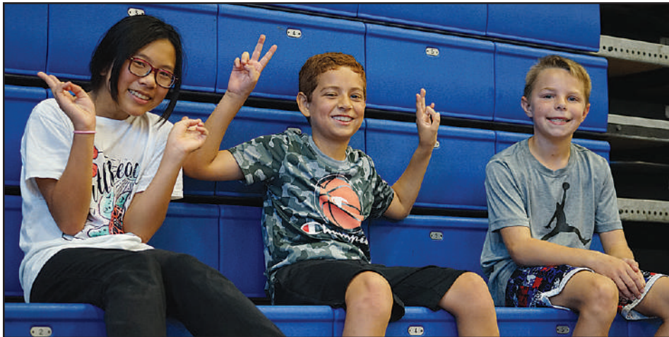
Three campers sit with each other and pose for a picture taken while they were on break between games on Tuesday, June 4.