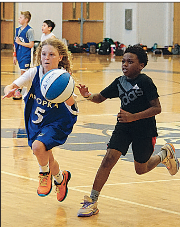
On Tuesday, June 4, a camper looks for a layup on a fast break during a five-on-five scrimmage.