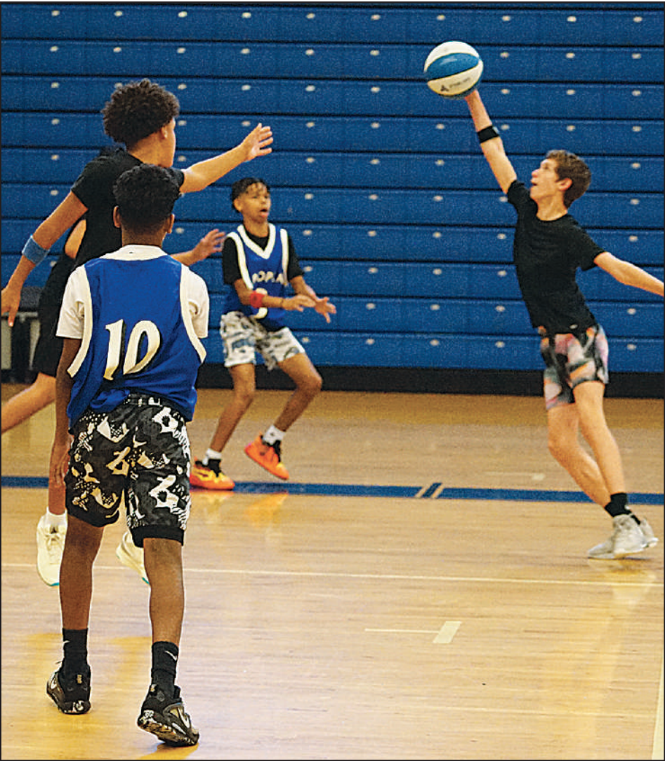
On Tuesday, June 4, a camper intercepts and steals a pass from another camper that set up a fast break.