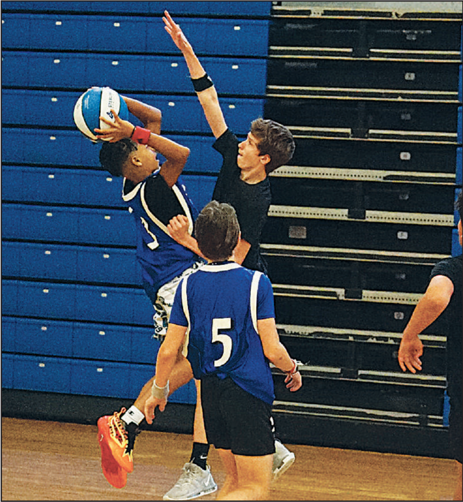
Two campers meet in the paint for a tough shot during a five-on-five scrimmage on Tuesday, June 4.