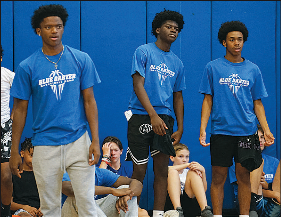
Three Apopka basketball player coaches watch over a five-on-five scrimmage of their teams playing against each other.