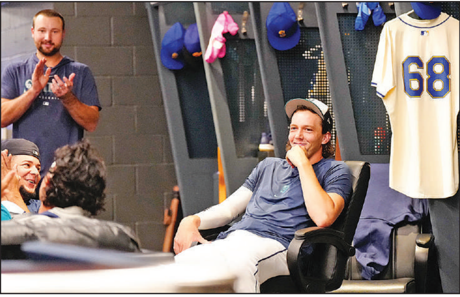
Logan Gilbert smiles as his first reaction to hearing the news of being selected to the All-Star team.