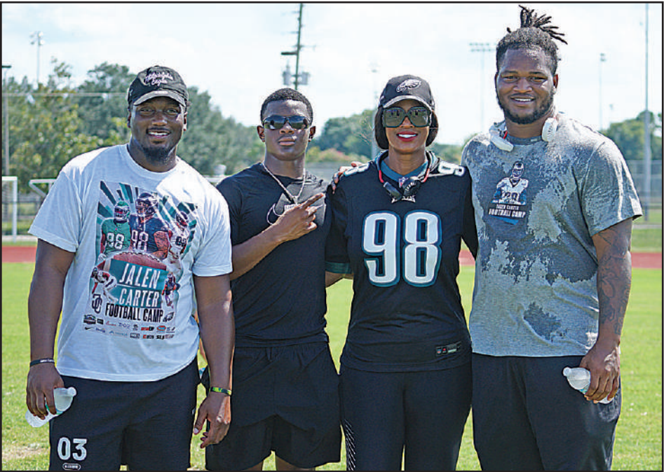
Jalen Carter (r) stands with his family during his camp in the very hot Florida heat at Apopka High School on Saturday, July 13.