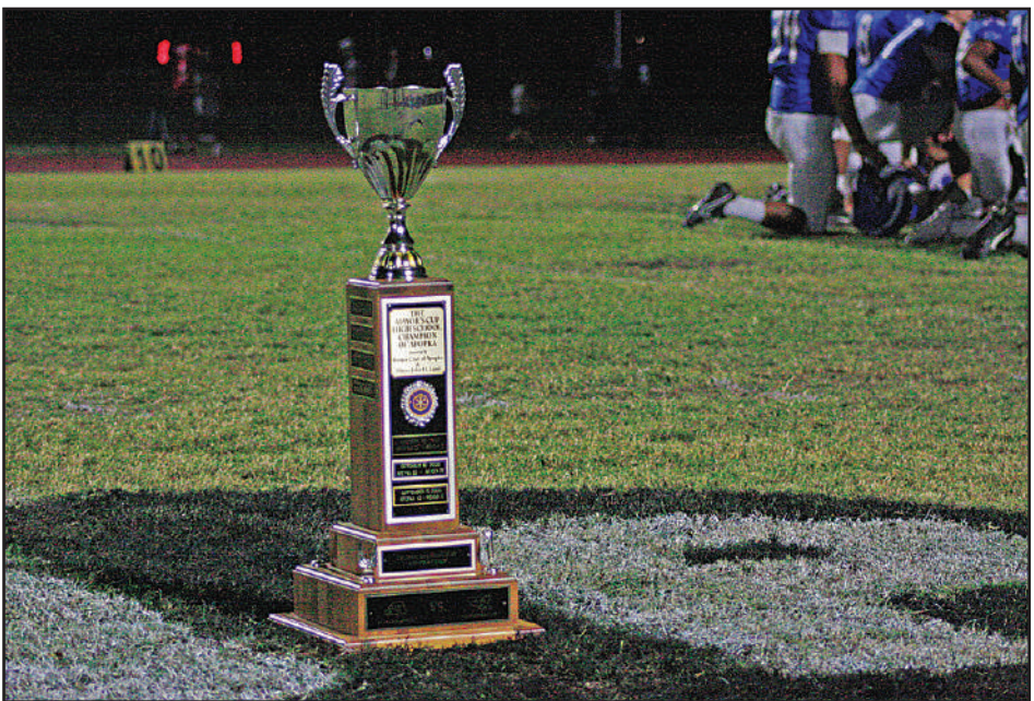
Photo depicts the Mayor's Cup on Roger Williams Field after Apopka beat Wekiva 29-28 on November 3, of 2023.