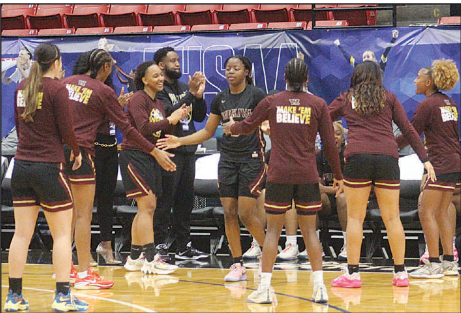
The Wekiva Mustangs girls basketball squad takes the court during the FHSAA Final Four in Lakeland on Thursday, March 7.