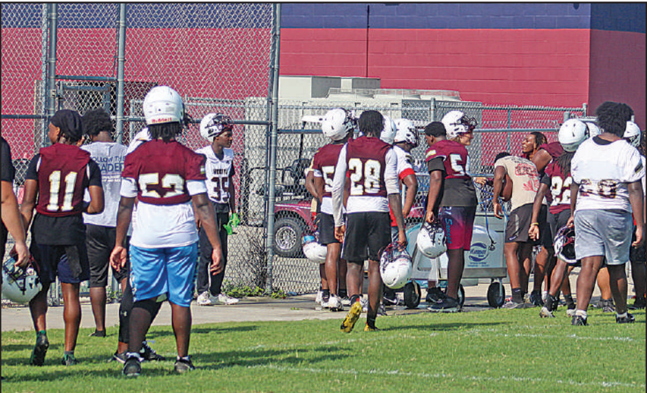
The Wekiva High School football team take a water break to cool down and rehydrate during a fall practice.