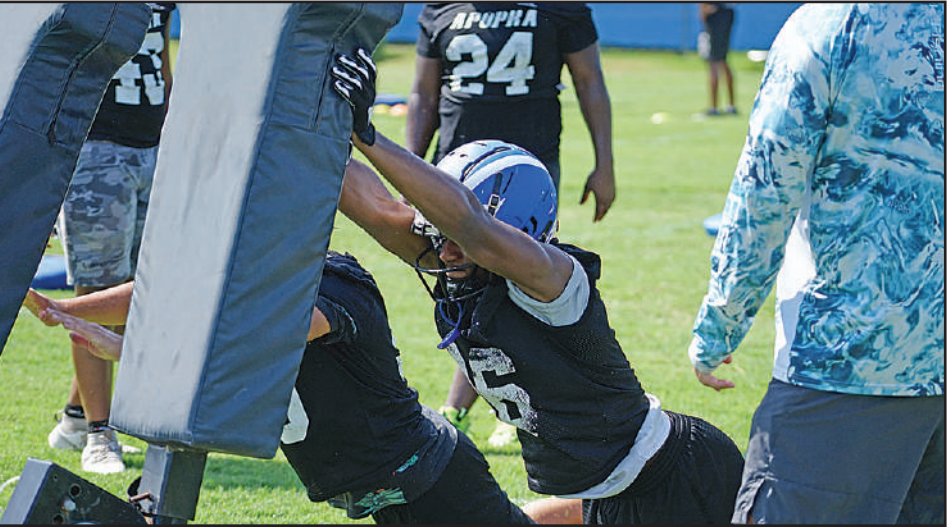
Two Apopka Blue Darter defensive linemen work on explosive strength without the use of their legs.