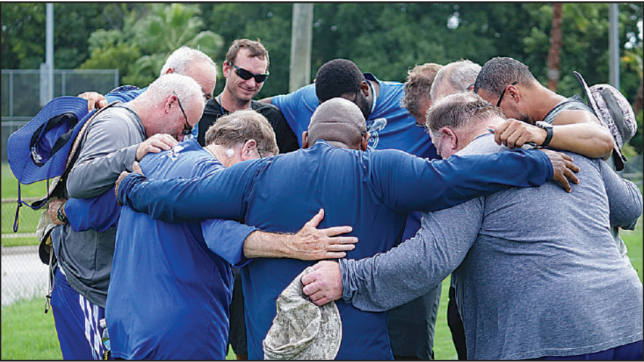
Apopka's coaching staff circle up and pray together at the end of practice on Wednesday, August 7.