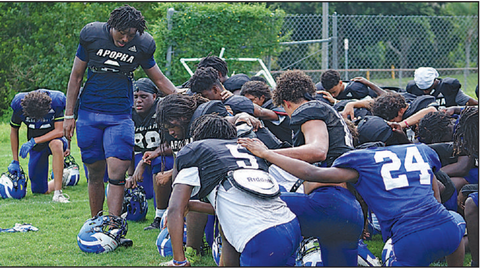
On Wednesday, August 7, the Apopka football team stay on one knee and pray together after practice.