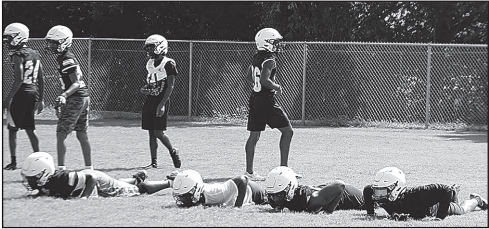
A group of Wekiva players do up downs during fall practice which helps with conditioning and more.