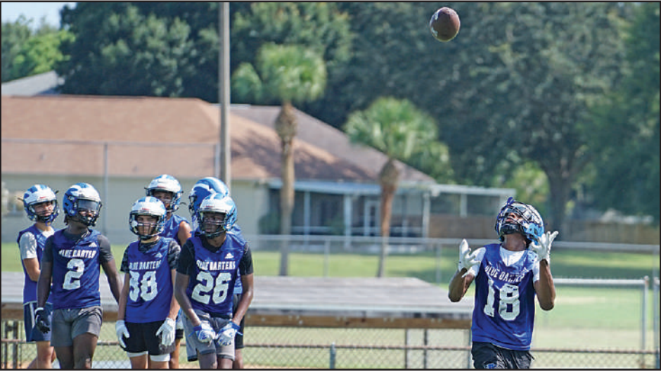
An Apopka Blue Darter receiver waits for an over the shoulder pass to drop while working on catching drills.