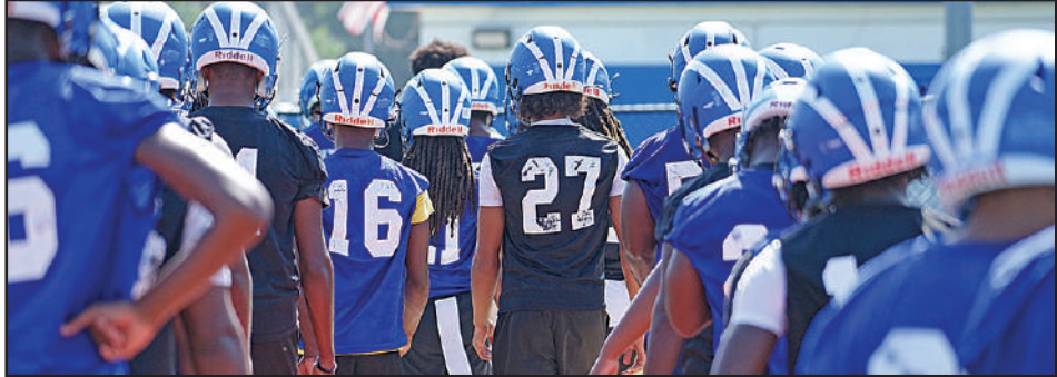
The Apopka football team heads to the practice field together after stretching and warming up early in the morning.