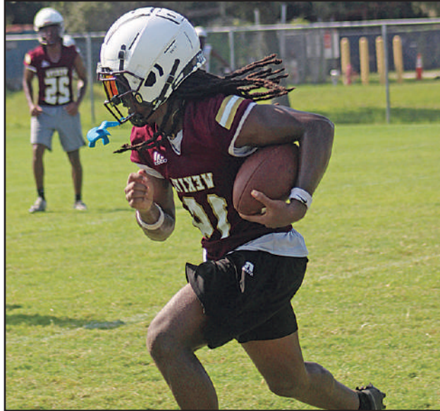
A Wekiva quarterback tucks the ball and looks for a first down after the pocket collapsed at practice.