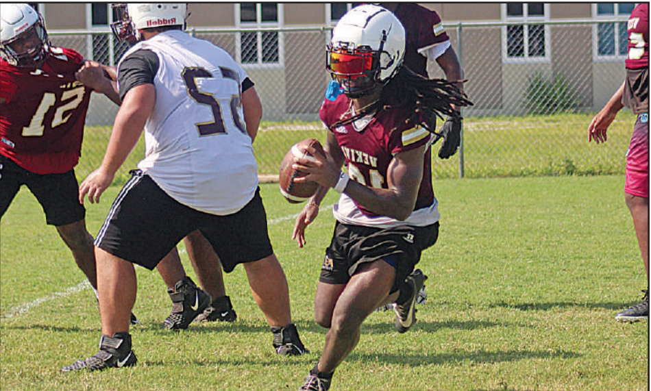
A Wekiva quarterback scrambles out of the pocket as it begins to collapse looking for a play down field.