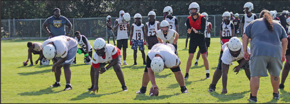
A Wekiva quarterback practices cadence and waits for a snap as the team work on a play at fall practice.