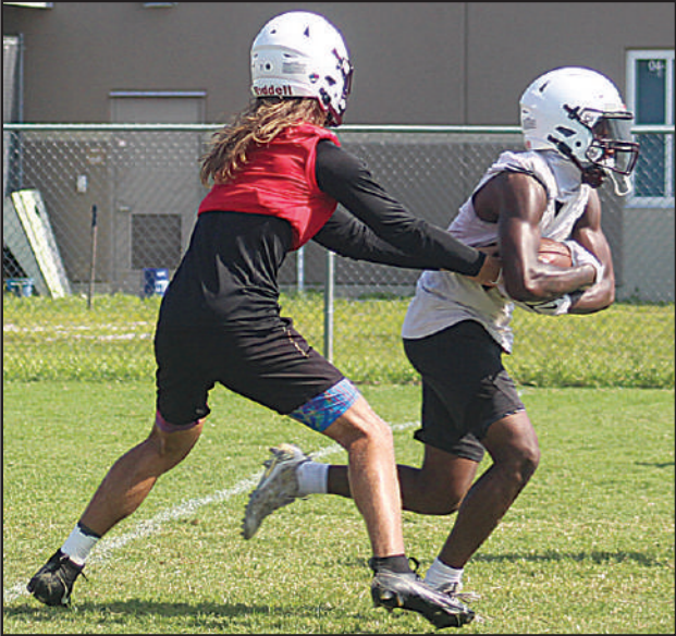
A Wekiva quarterback hands off a ball to a running back heading through the middle of offensive line.