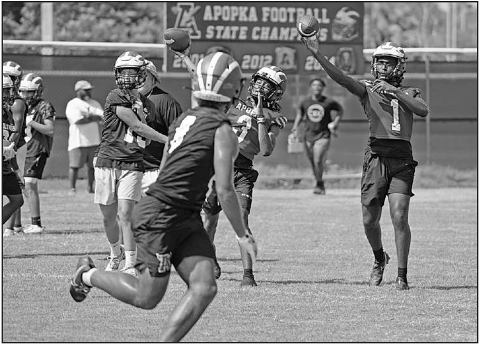
All three of Apopka’s quarterbacks practice throwing different passes in different sections of the field working on accuracy and placement.

Apopka has some work to do before they are ready for a deep playoff run but hold all the cards to do it. The key will be being patient, continuous hard work, and keeping that mentality of hating losing more than loving winning.