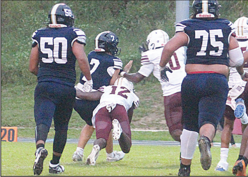
The Wekiva defense sack the Eustis Panthers quarterback for a major loss of yards on Friday, September 13.