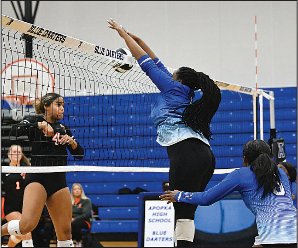
An Apopka player blocks a hit at the net against Sanford Seminole as the Seminoles went on to win.