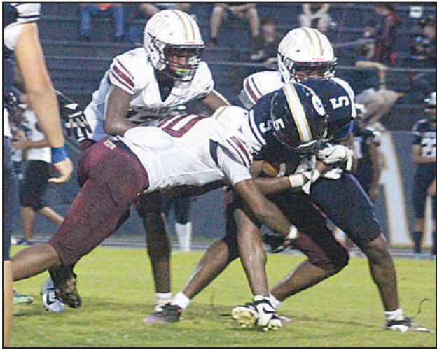
On Friday, September 13, the Wekiva defense comes up with a huge tackle for loss.