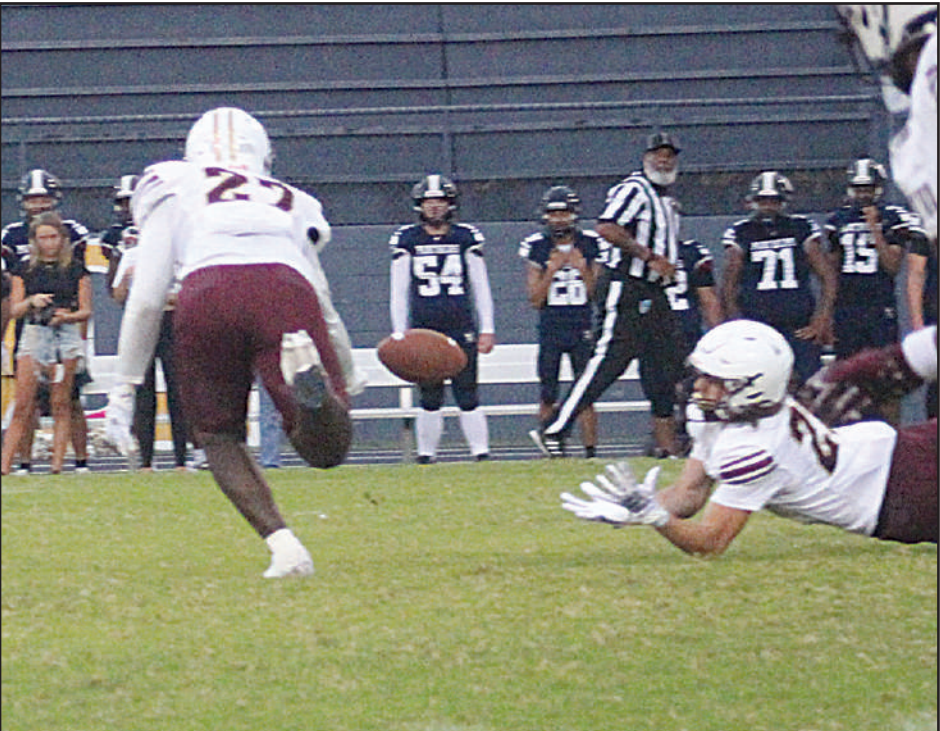
On Friday, September 13, a Wekiva defender dives for a wild pass, almost securing an interception for the Mustangs.