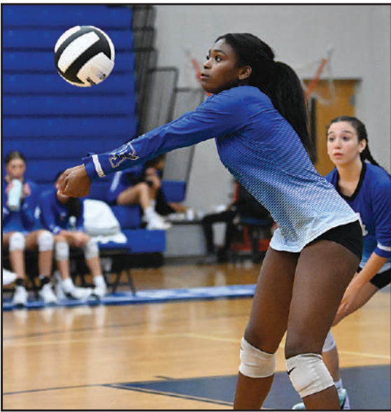
A Lady Darter passes a ball to a teammate during Tuesday evening's match.