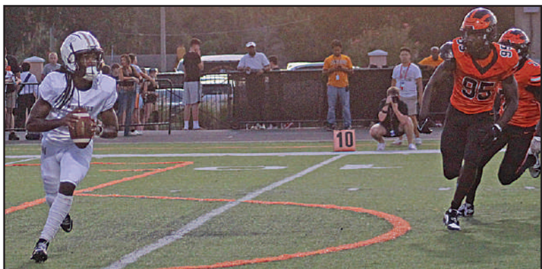
On the left, Wekiva's punter does his best to punt the ball away before being tackled by a Lion because he fumbled the snap. On the right, A Wekiva quarterback scrambles looking for an open receiver while being tracked down by the Lions' defense.