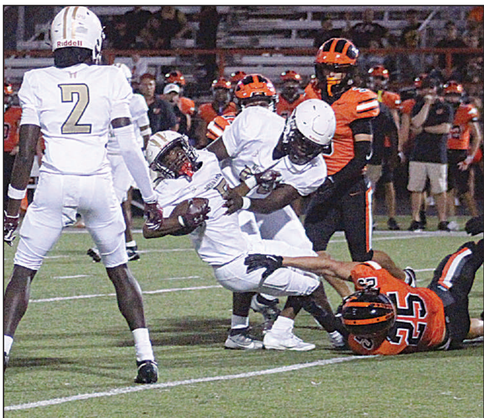
A Mustang ball carrier falls forward and reaches for extra yards as he goes down in Wekiva's loss to the Lions on Friday, September 27.