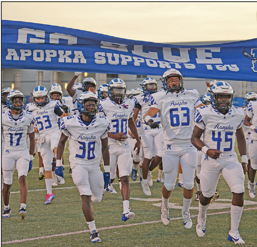
The Apopka Blue Darters enter the West Orange field before the game on Friday, September 27.