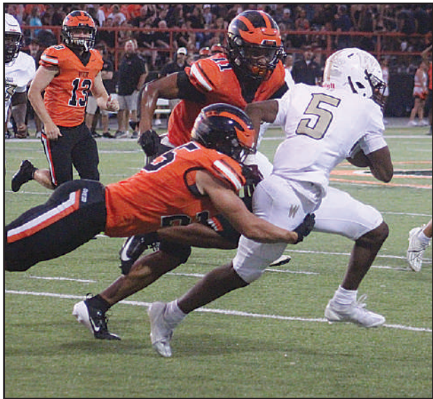
A Wekiva ball carrier slips by Oviedo defenders as one dives to tackle him during the Mustangs' 52-27 loss.