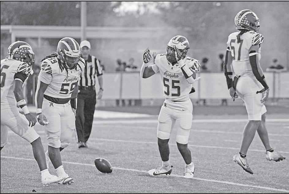
The Apopka defensive line celebrate a huge sack deep in the Warriors' territory on Friday, September 27.