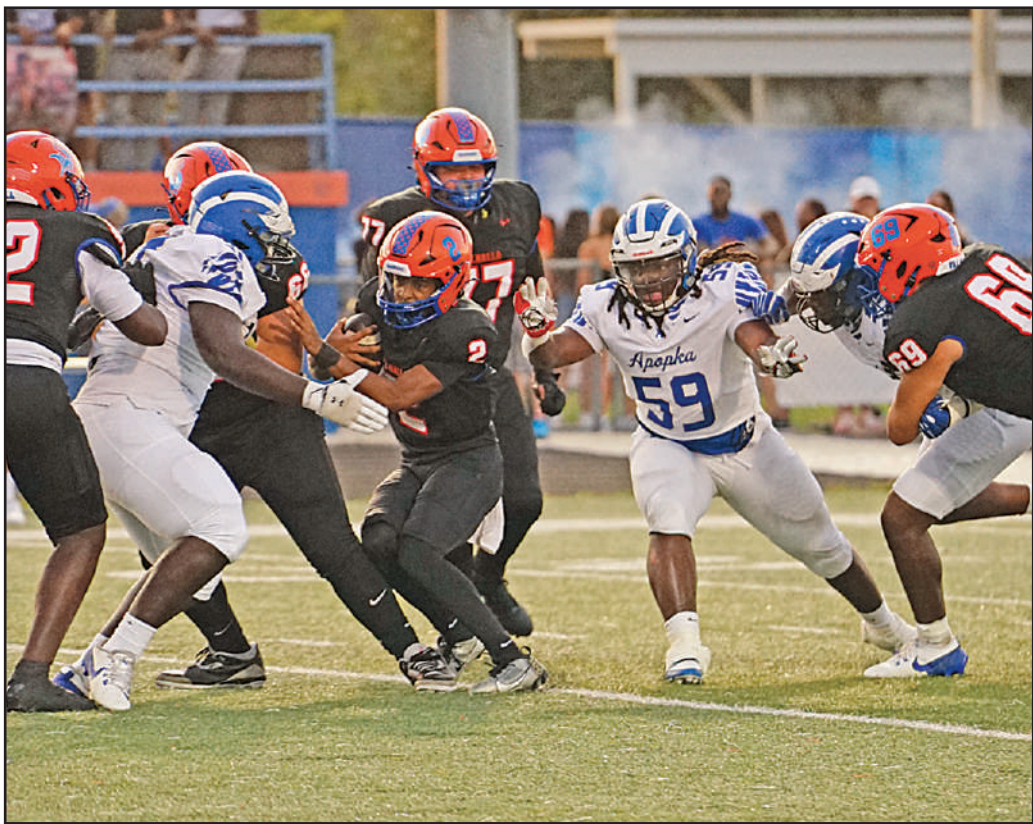
The Apopka defensive line close in on the Warriors' quarterback leaving him no escape resulting in a sack for the Blue Darters.