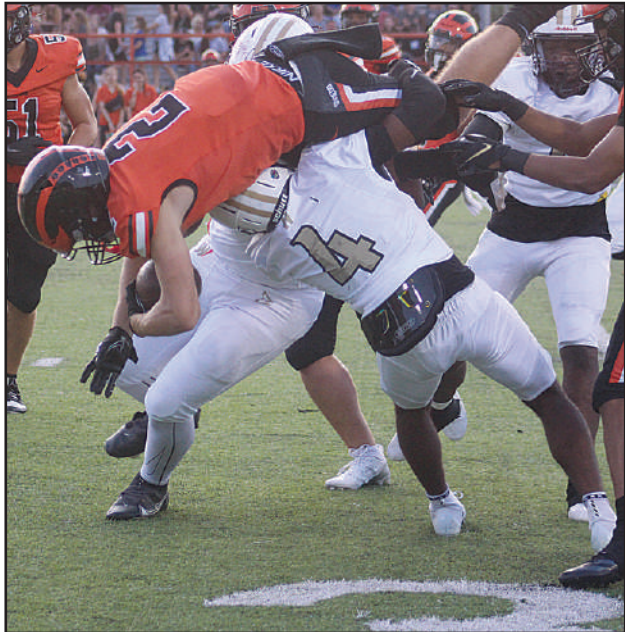
A Wekiva defender gets under a Oviedo player for a tackle on Friday, September 27.