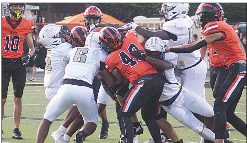
On Friday, September 27, the Wekiva defense work on bringing down a Lions' return man.