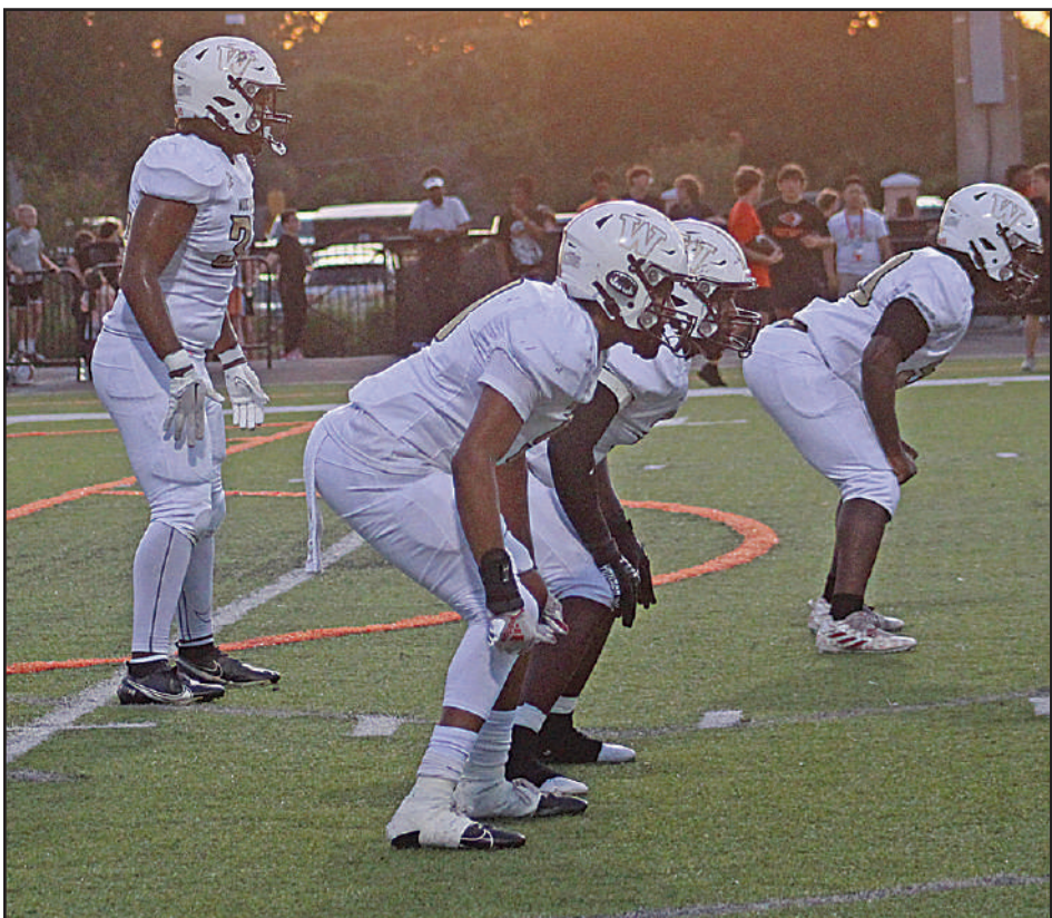
The Wekiva Mustangs come out in a "heavy" or "full house" offensive formation focused on strength and size to get a first down.