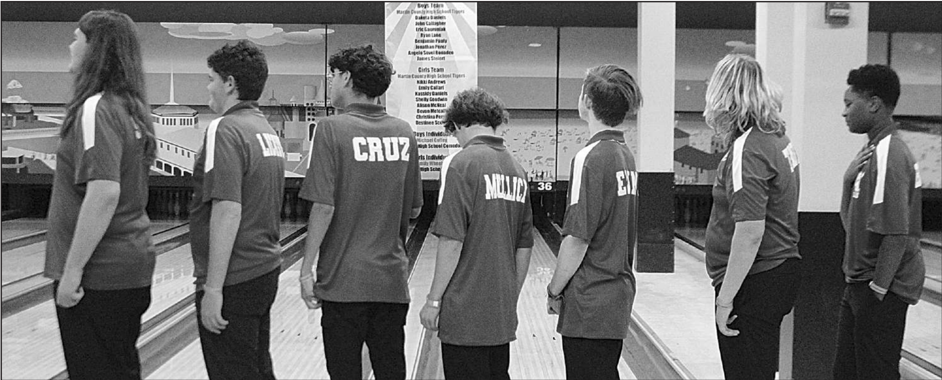
On Tuesday, October 29, the Apopka Blue Darter bowling team stand together as the pledge begins during the FHSAA State Championship meet. Apopka made it to the first round of the double-elimination component of the meet.