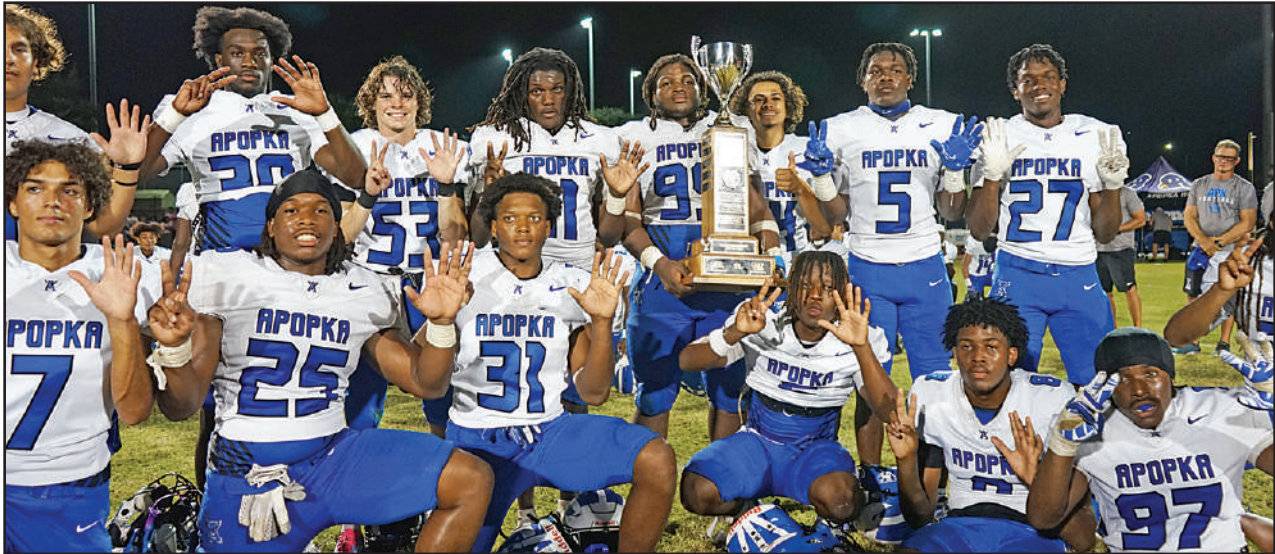
In the photo above, the seniors on the Apopka football team stand together holding up the Mayor's Cup and 25 (their graduation year) after their final regular season game as Blue Darters on Friday, November 1.

in the second quarter, the third quarter was quiet coming out of halftime, and then the explosive fourth quarter.