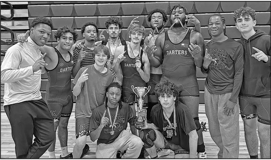
The Apopka High School Wrestling team hold their trophy and the number one up celebrating their first-place finish at Gauntlet on the Grove on Saturday, Dec. 14.