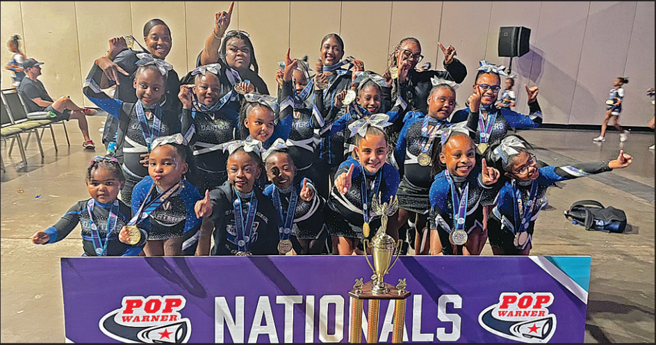
The Apopka Pop Warner Mitey Mites pose together after placing first at the Pop Warner National Cheer and Dance competition.