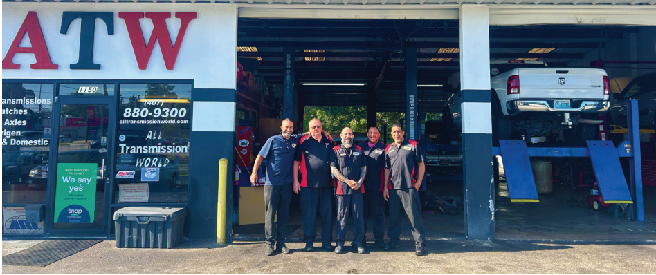
To keep you and your loved ones safe on the road, take your car to an auto repair shop that is widely known for their superior service and expertise. Visit All Transmission World, conveniently located at 1150 E. Semoran Boulevard in Apopka. Call them today at 407-880-9300.

Located in Apopka, All Transmission World has been proudly serving the Greater Orlando area (Orange, Osceola, Seminole, and Lake counties) since 1982. Their goal has always been to provide outstanding customer service while delivering a quality product at an affordable price, sup-