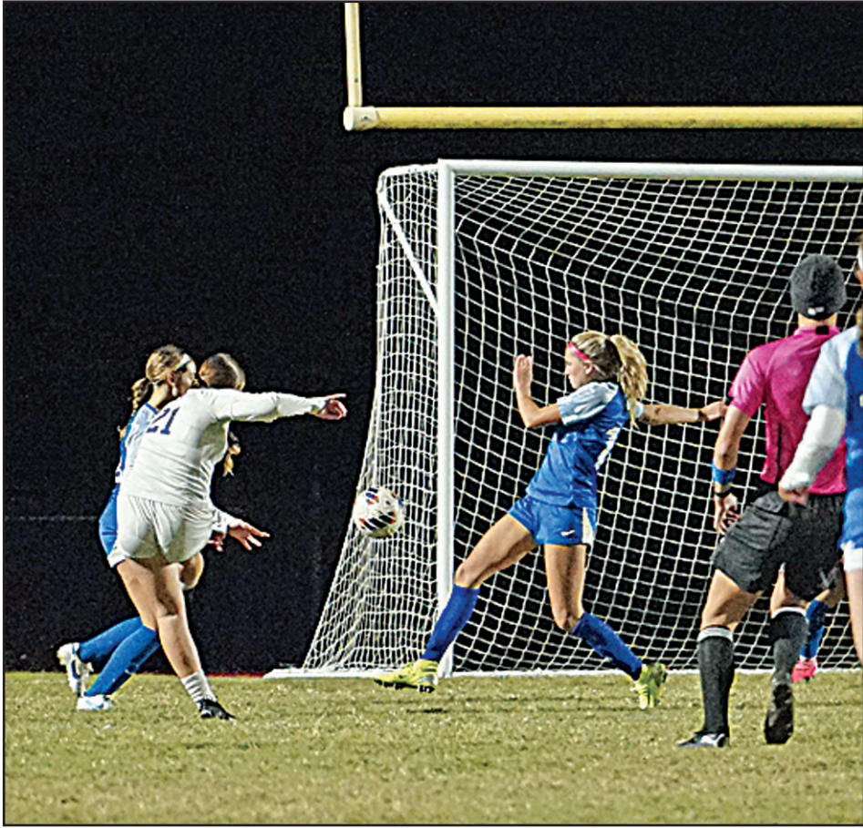
Two Apopka defenders close in on a Warriors' attacker as she takes a shot at their goal during their loss to West Orange.