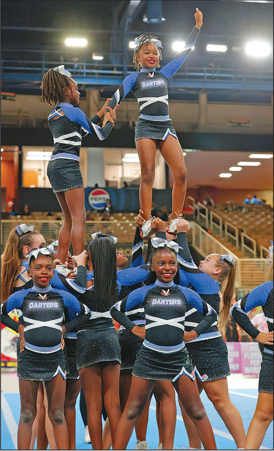
Above is the Jr. PeeWee Pop Warner cheer team who placed first at Mid Florida and second at regionals earning them a spot at nationals.