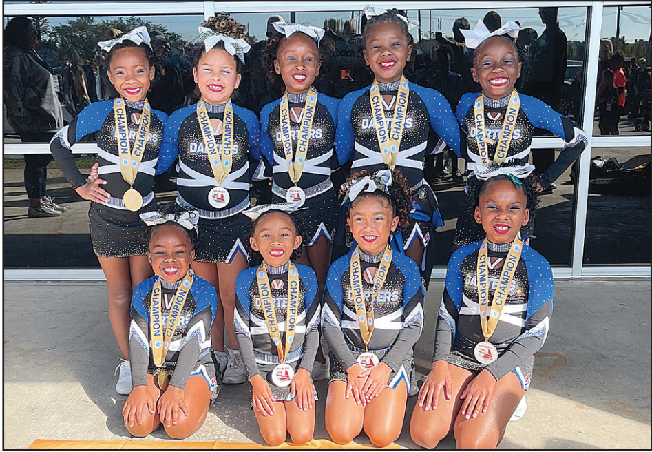
Pictured above are the Apopka Pop Warner Tiny Mites cheerleading squad. The Tiny Mites placed first at the Mid Florida and regional competitions.