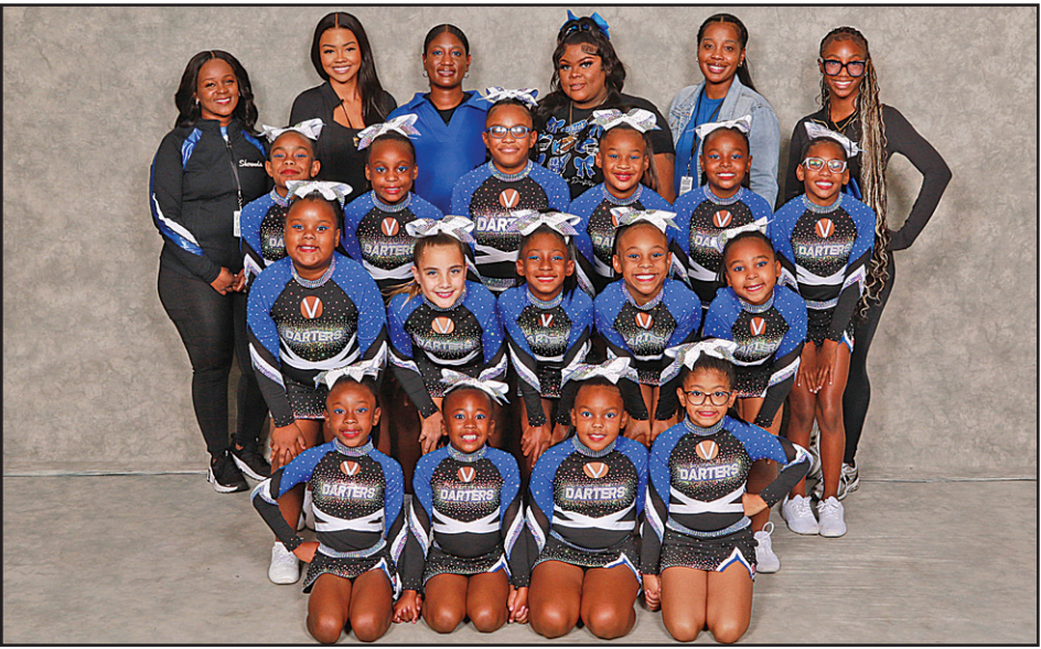
The two photos above are of the Mighty Mites who placed first at Mid Florida and second at regionals earning them a spot at nationals.